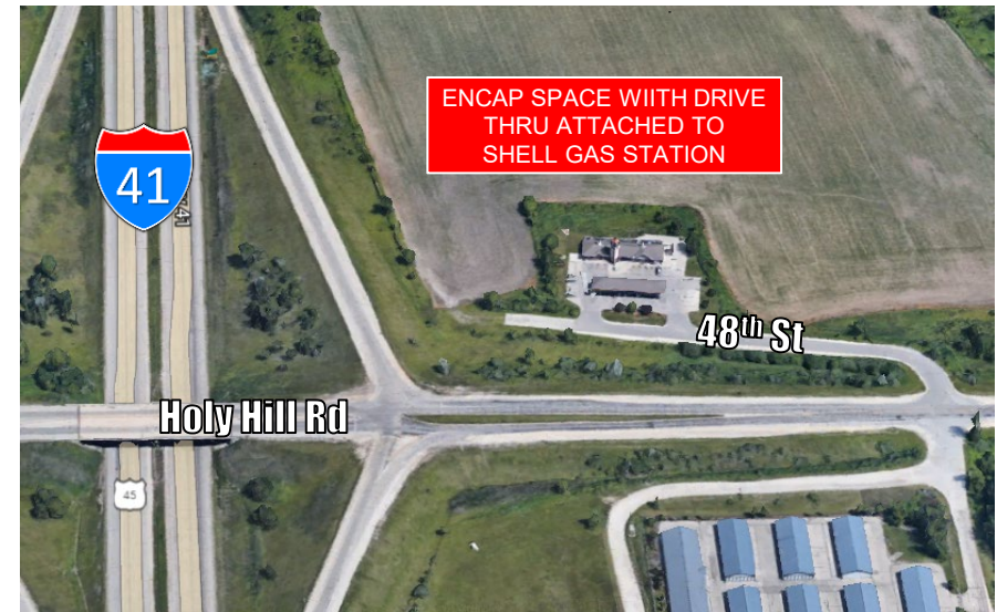
Aerial facing north; subject site accessible via Holy Hill Rd