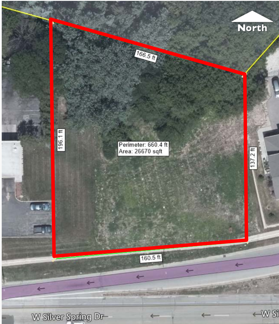
*Measurements are approximate.